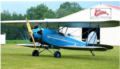
Sam Dodge Seattle 1931 Bunner Winkle Bird