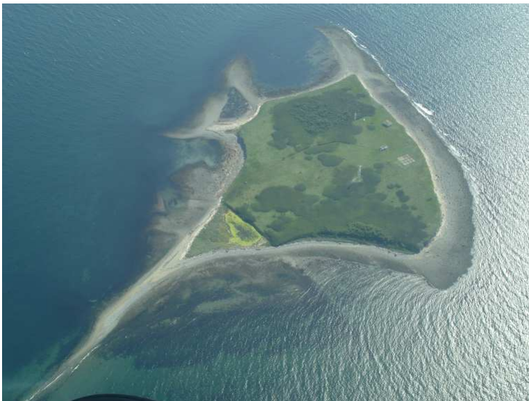
Here's a nice shot of Smith Island, from Tom Eades . This is the position that many of us think of a forced landing on this isolated rock (come on low tide!)

Oakland, CA (OAK) FS21 Refit Target Completion Date 6/11/2007 Denver, CO (DEN) FS21 Refit Scheduled 5/14/2007 to 6/25/2007 Honolulu, HI (HNL) FS21 Refit Scheduled 6/11/2007 to 7/23/2007 San Diego, CA (SAN) FS21 Refit Scheduled 5/28/2007 to 7/9/2007 Seattle, WA (SEA) FS21 Refit Scheduled 6/18/2007 to 7/30/2007