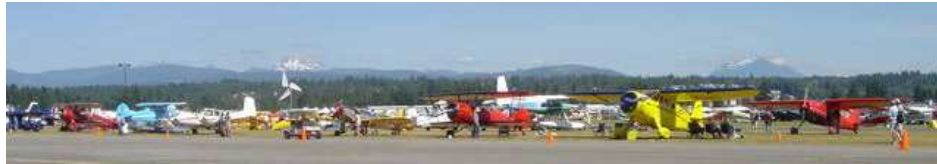
The flight-line at Arlington July, 2006

July 21-23 - Concrete Old Fashioned Fly-In.