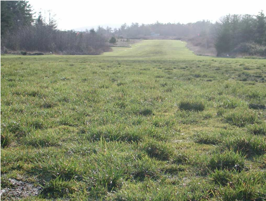
Ready for departure on 15 , at Decatur Shores.

Decatur shores is for the private use of Decatur Shores members only, but permission to land can be gotten by calling Don Hall, at 360 375 6044, or email hallcraft@interisland.net . Other public access is by commercial air carriers.